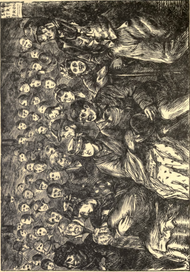
A Cheap Theatre—Saturday Night.